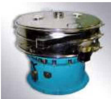
RS Twist Screens

Center-drive twist screens are used primarily for dry screening at a low throughput (t/h). The product is classified, dedusted, controlled and protected against contamination.