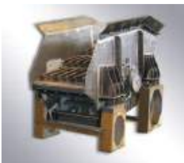
Circular-motion vibrating screens with eccentric shaft

Circular-motion vibrating screens , frequently called circular motion screens, are used to classify medium – and coarse-grained bulk material (5.0 – 300 mm), to provide protective screening and for dewatering. They represent a versatile solution for a variety of screening tasks. Circular-motion vibrating screens are screening machines that employ indirect excitation of the screen mesh. The entire screen frame is driven by unbalanced masses that create a circular vibrating motion. As a consequence, only minimal acceleration of the material being screened is possible. For this reason, circular-motion vibrating screens are best-suited for separating material in the medium and coarse grain size range. The undirected vibrations of