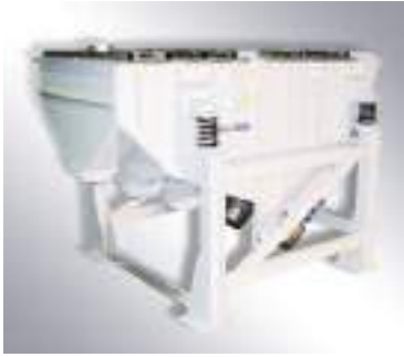
Linear-Motion Vibrating Screens

VSO/VSB Linear-Motion Vibrating Screens classify bulk material into several grain size ranges and differ from other screening systems through their use of a linear vibrating motion, among other characteristics. Their design allows these screens to be installed horizontally, so that very little installation height is required. A maximum of 3 screen decks