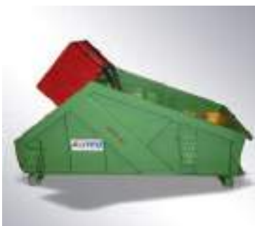
Vibrating Screens with exciter

VSO Vibrating Screens classify bulk material into several grain size ranges, remove small amounts of oversize and fines or separate impurities and foreign matters from the material being screened. Traverse are available for material flow rates ranging from a few kg/h to 600 t/h and higher.