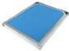
Size: Medium (415 x 495 x 50T)