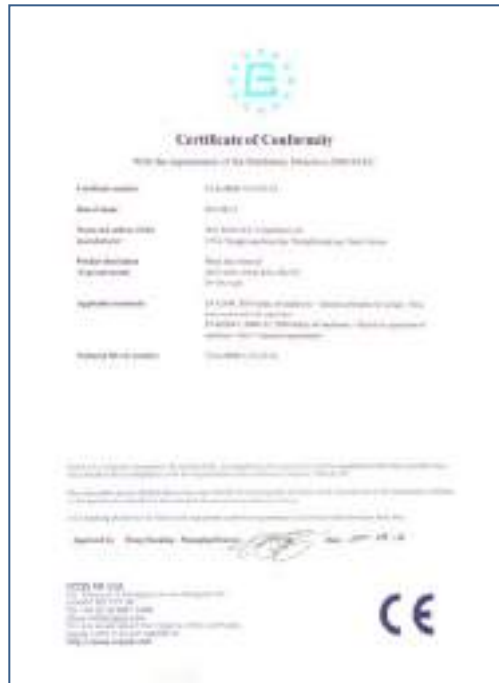
CE Certificate (Shoe Sole Cleaner)