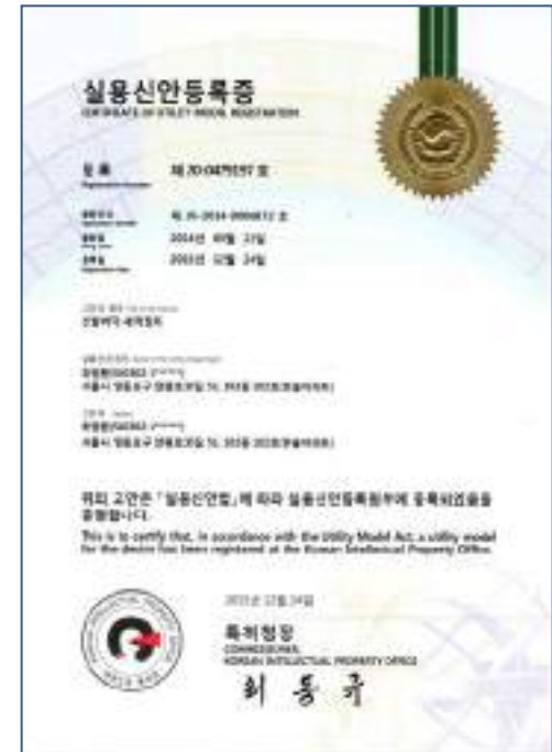
Utility Model Certificate (Shoe Sole Cleaner)